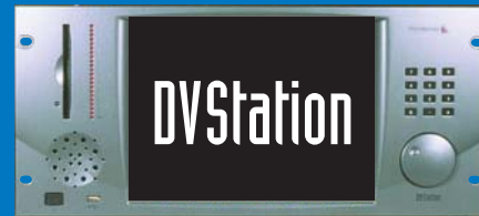
DVStation: Advanced Monitoring for Digital Networks